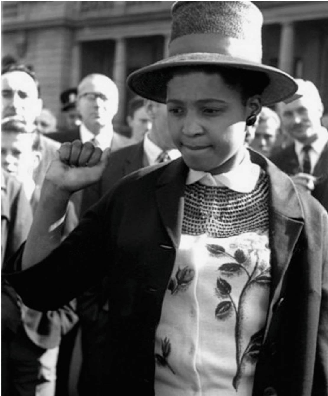
Winnie MANDELA – 1964