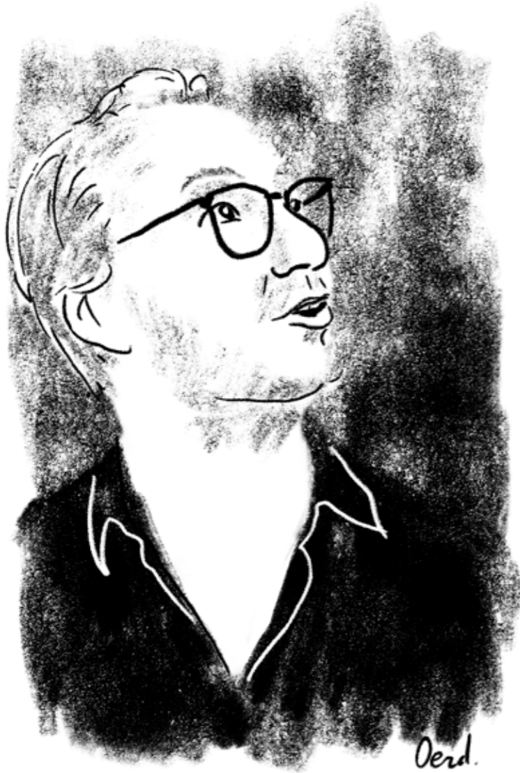
Drawing : OERD

Champeaux was born into a Franco-American household in 1975.