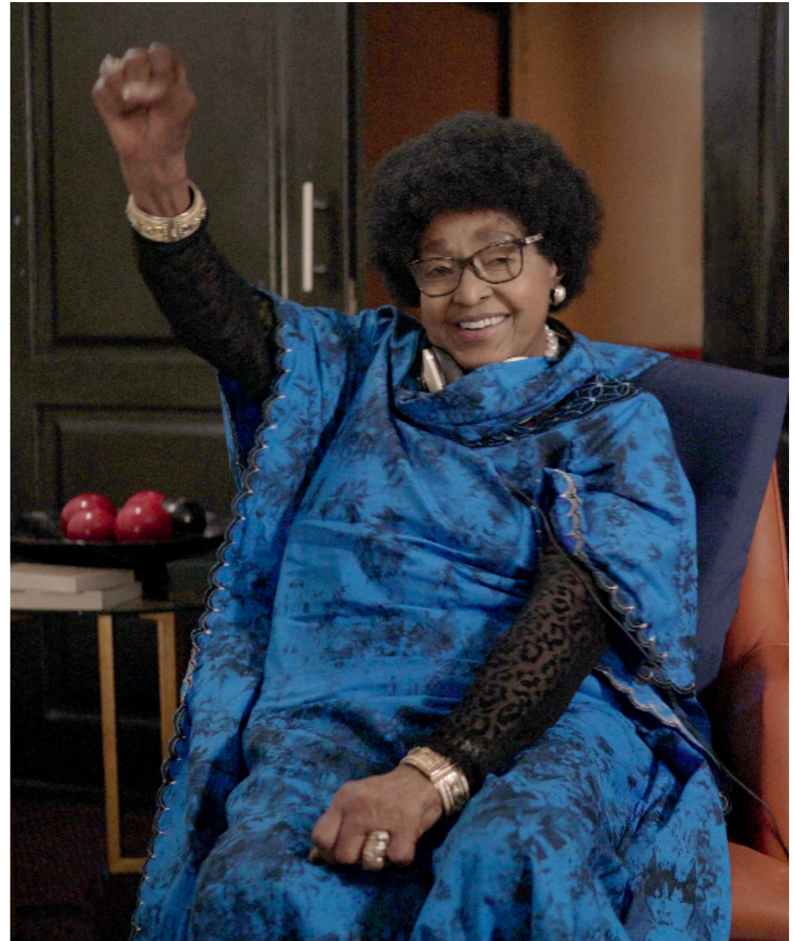
Winnie MANDELA – December 2017