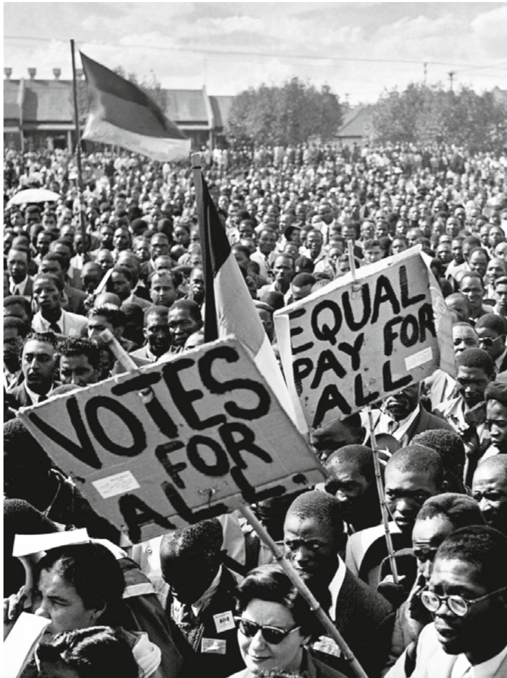
South Africa – 1960s

1948 Victory of the nationalist Afrikaners in the general election. Implementation of apartheid policies: restricted movement for non-Europeans and expulsion of blacks from urban centres and relocation to housing zones outside city centres. Inter racial marriages are banned.