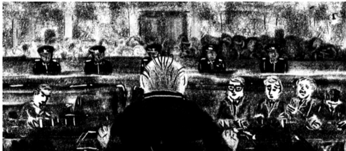
Drawing : OERD