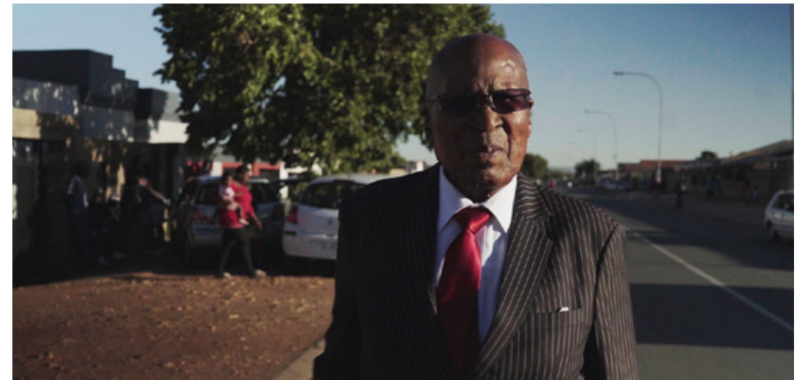
Andrew MLANGENI in the streets of SOWETO – december 2017