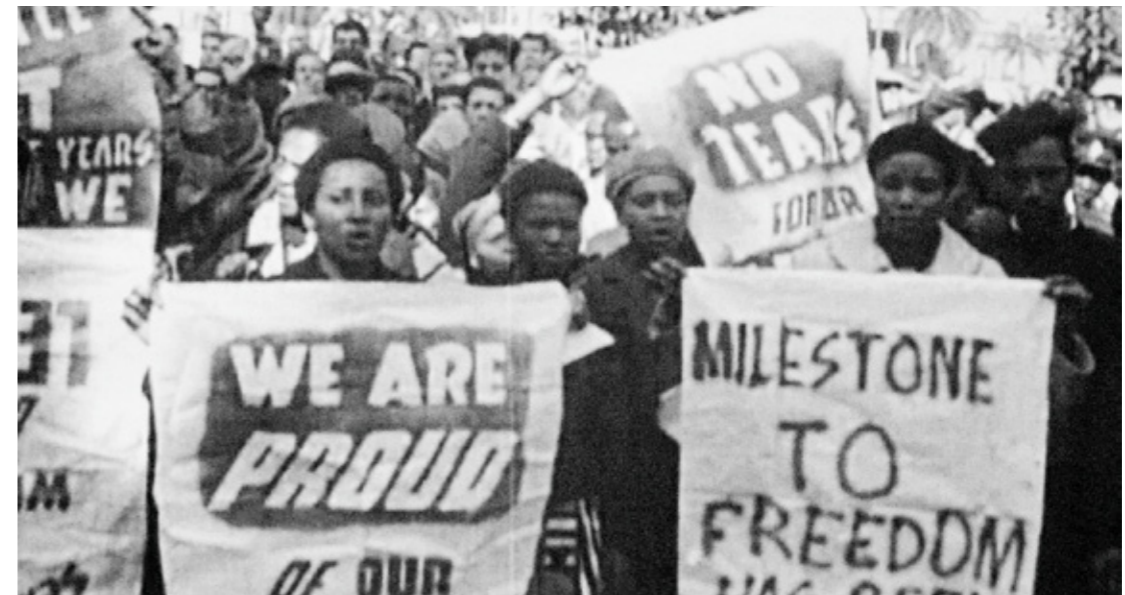
South Africa – 1960s