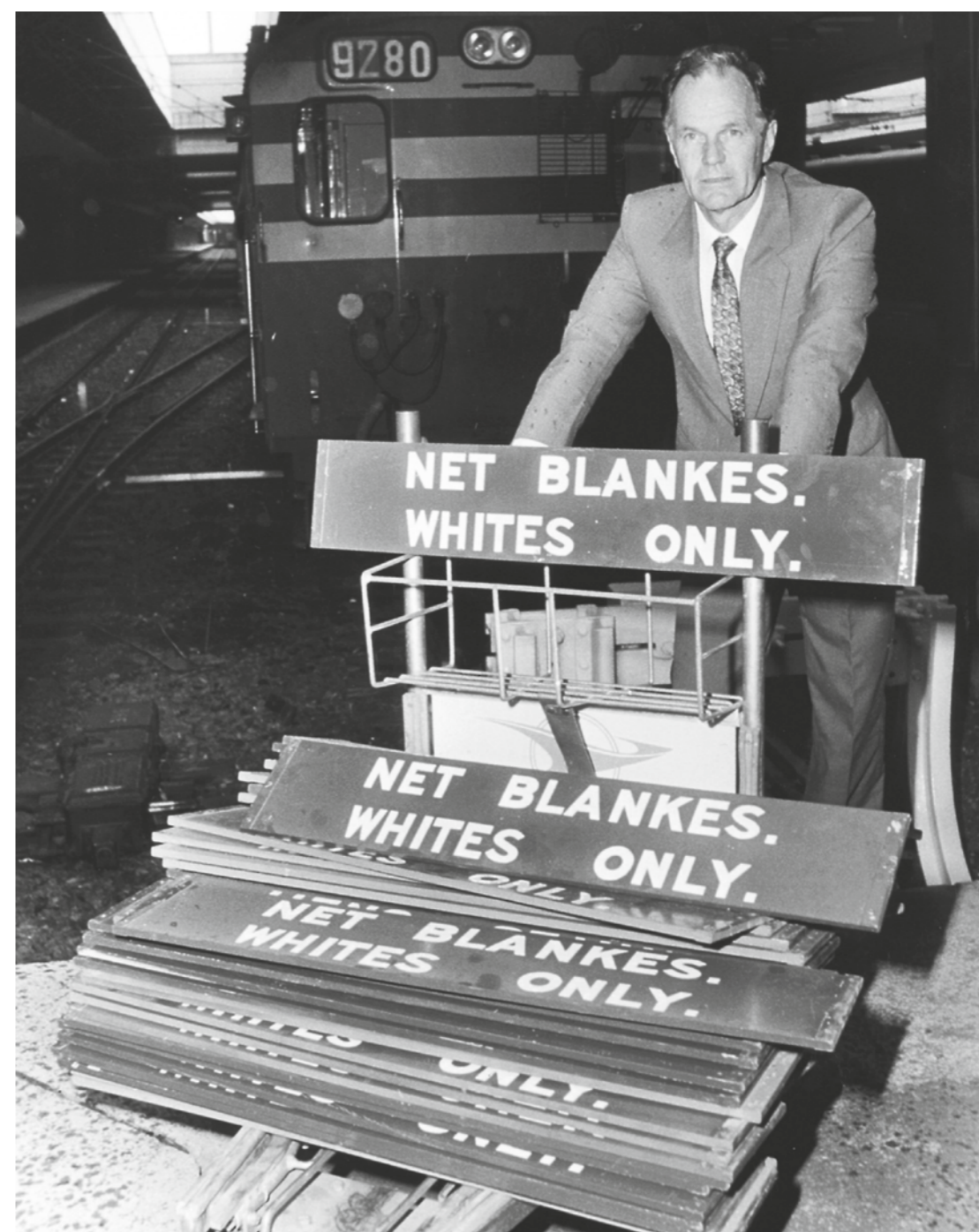
South Africa – 1960s

N.C. That's right and in fact the apartheid government shot itself in the foot. One of the main planks of apartheid had been